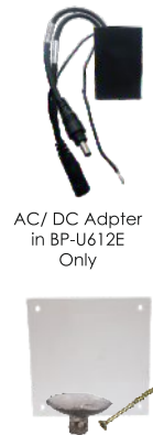
AC/ DC Adpter in BP-U612E Only